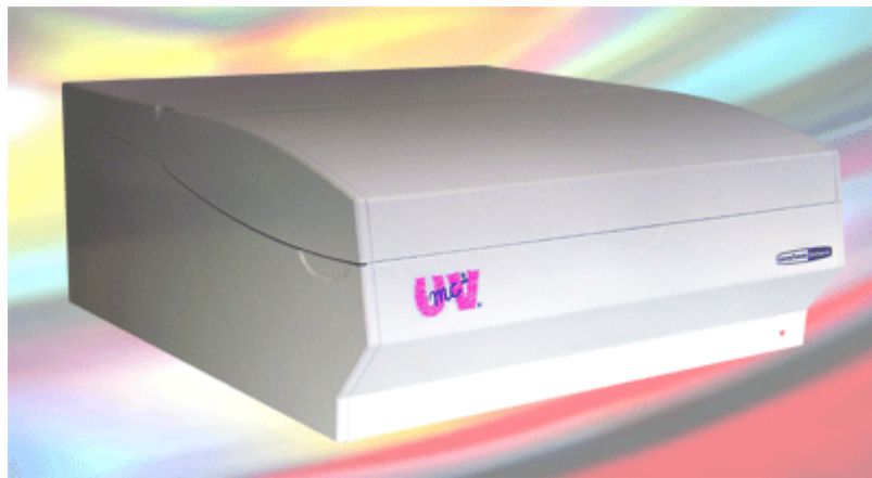
Spectrophotomètre SAFAS UVmc2

Finally, you demand an user friendly software, fitted with all the possibilities of data processing and exports.